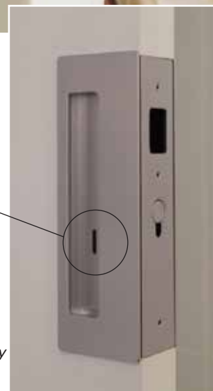
5 - CL400 Privacy - Emergency Release/Snib option. Matte Chrome finish.

Emergency Release can be activated with a pen in an emergency.