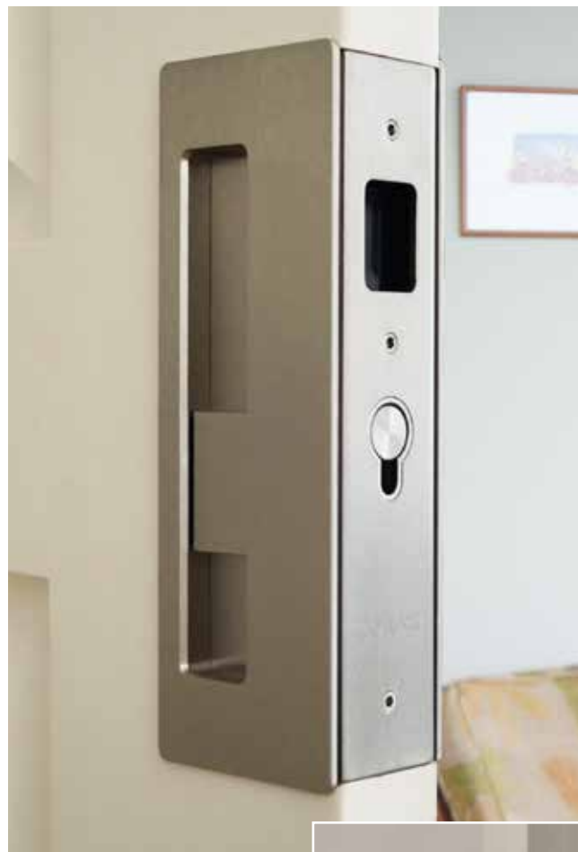
4 - CL400 Privacy Snib/ Snib option. Satin Nickel finish.