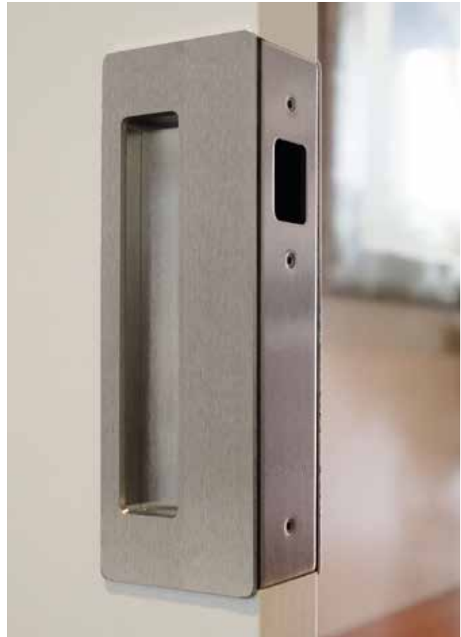
2 - CL400 Passage (non latching). Satin Chrome finish.