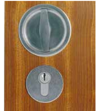
CL100 Flush Turn with key.

Please note that this specification must be done at time of order.