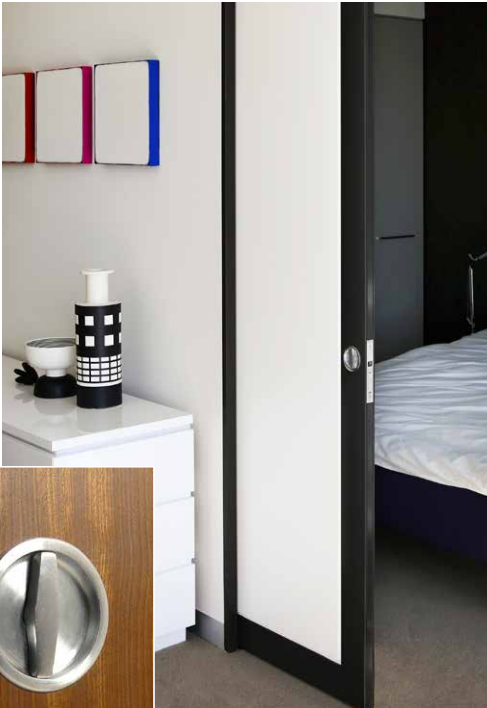
A CaviLock CL100 Flush Turn in Satin Chrome

Requires minimum door thickness of 1-1/2" (37mm).