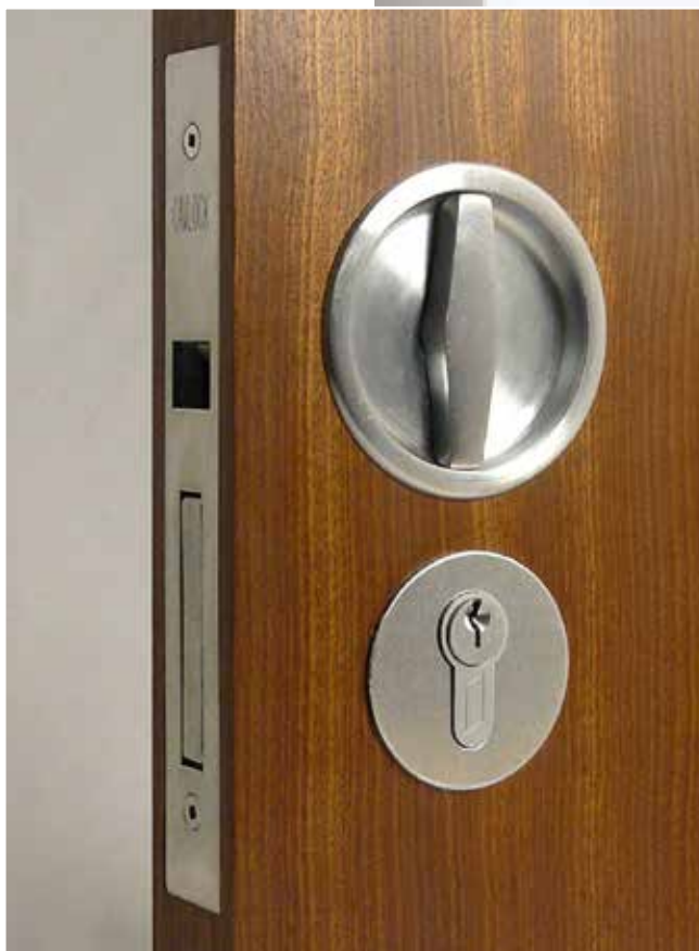
A CaviLock CL100 Flush Turn with Key in Satin Chrome