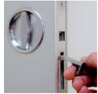
CL100 Flush Turn and Flush Pull on aluminum door leaf.

This Flush Pull is designed for use on doors which slide completely inside a wall.