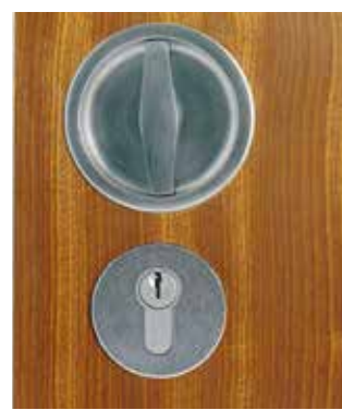
CL100 Flush Turn with key.

Please note that this specification must be done at time of order.