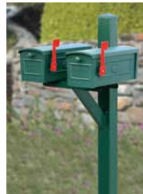
Modern style decorative post (#4825) can accommodate two (2) wide and three (3) wide spreaders (see page 77).