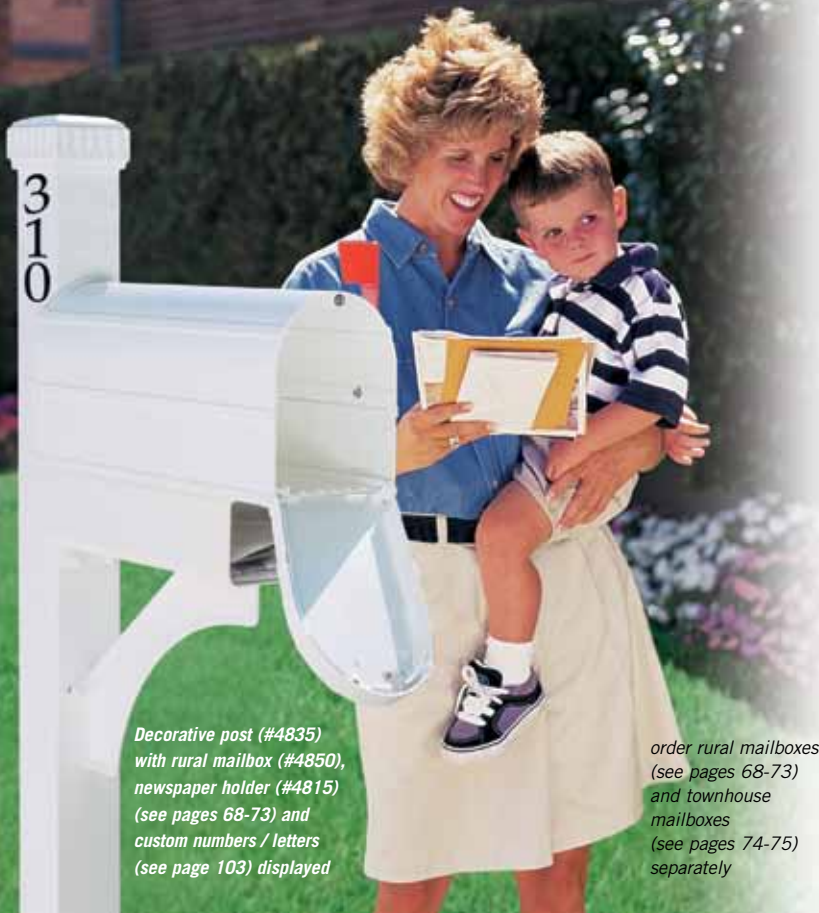
Decorative post (#4835) with rural mailbox (#4850), newspaper holder (#4815) (see pages 68-73) and custom numbers / letters (see page 103) displayed