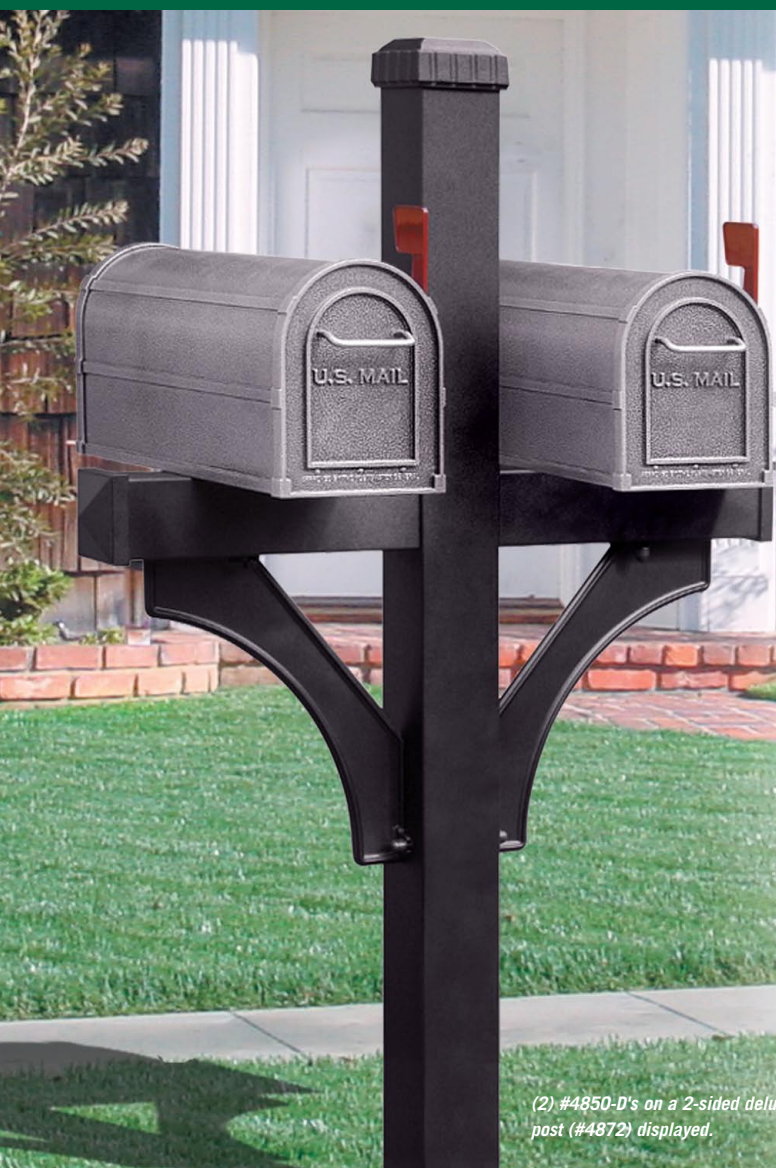
(2) #4850-D's on a 2-sided deluxe post (#4872) displayed.