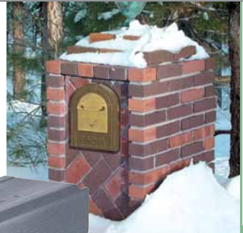
#4855E in a brick column displayed