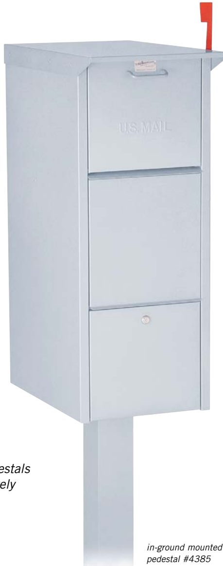
in-ground mounted pedestal #4385