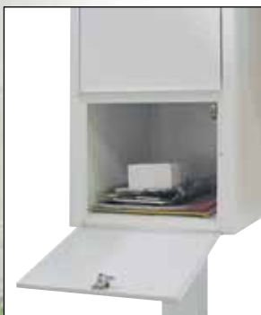
Rear view of #4375 displayed