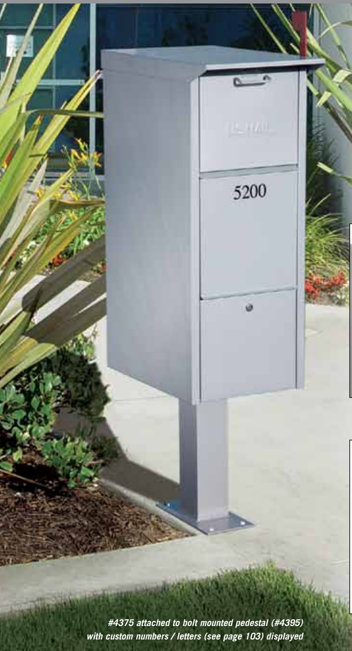
#4375 attached to bolt mounted pedestal (#4395) with custom numbers / letters (see page 103) displayed