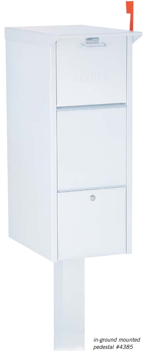
in-ground mounted pedestal #4385