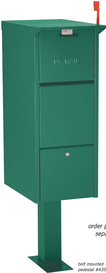
bolt mounted pedestal #4395