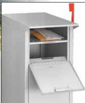
Front view of #4375 displayed