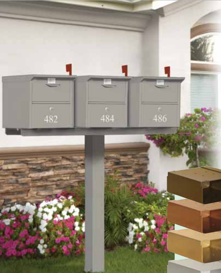
(3) #4325D's on a three (3) wide spreader (#4383D) attached to an in-ground pedestal (#4385D) with custom numbers / letters (see page 103) displayed