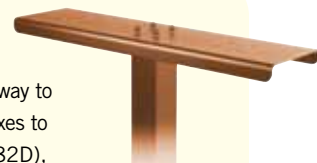
#4382D on a designer pedestal (#4365D) displayed

Made of heavy duty aluminum, Salsbury designer spreaders are an ideal way to mount multiple designer roadside mailboxes to pedestals. Optional two (2) wide (#4382D), three (3) wide (#4383D) and four (4) wide (#4384D) spreaders easily attach to standard pedestals (#4365D and #4385D).