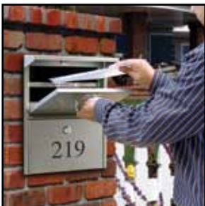
Front view of (#4325D) mounted in a column with custom numbers / letters (see page 103) displayed

Made entirely of aluminum, Salsbury U.S.P.S. approved 4300 series designer roadside mailboxes feature both a front and rear access locking door. Available in a powder coated bronze, copper, brass or nickel finish, each unit includes an outgoing mail tray, a lock with two (2) keys on each door (keyed alike) and an adjustable burgundy signal flag. Mail is deposited through a non-locking access panel on the front. Designer roadside mailboxes can be mounted on the optional bolt mounted (#4365D) or in-ground mounted (#4385D) aluminum designer pedestals, in-ground mounted aluminum designer deluxe posts (#4370D, #4372D, #4373D and #4374D) or a base of your choice. Designer roadside mailboxes can also be mounted in columns, masonry or walls. Designer newspaper holders (#4315D) and non-locking thumb latches (#4388) are available as options upon request. Designer roadside mailboxes are approved for U.S.P.S. curbside mail delivery. Master postal lock not required.