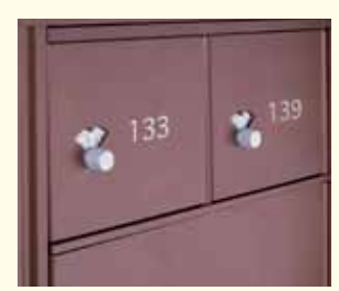
Custom horizontal mailbox with com- . Self-adhesive numbers - sheets of (100) bination locks (#3686) and custom regular engraved doors (#3668) in bronze finish displayed.