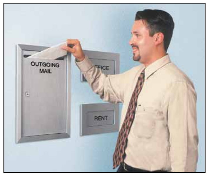
Recessed letter box (#2245) and (2) mail drops (#2255 - see pages 48-49) with optional custom engraving - black filled (#2266) displayed