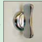
#2256 with optional custom engraving - regular (#2266) and mail drop (#2255) displayed

A non-locking thumb latch is available as an option upon request. $10.00