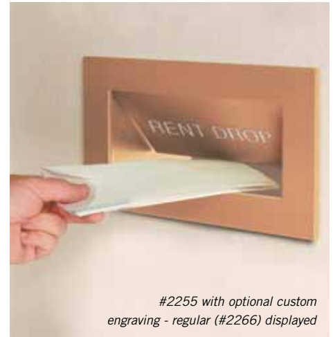
#2255 with optional custom engraving - regular (#2266) displayed