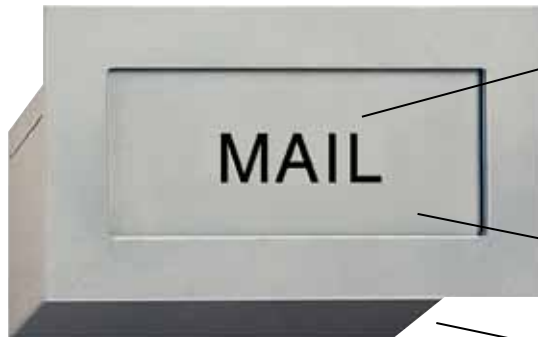
#2255 with optional custom engraving - black filled (#2266) displayed

Constructed of 1/4" thick aluminum plate and 20 gauge steel, Salsbury recessed mounted mail drops feature a spring-loaded mail flap and an adjustable mail flap stop. Mail drops also feature a durable powder coated finish available in five (5) contemporary colors. Custom engraving (#2266) is available as an option upon request. An optional receptacle (#2256 - see page 49 - order separately) aligns with the mail drop chute for receipt of deliveries. Mail drops are ideal for collecting documents and small packages and may be used for U.S.P.S. residential door mail delivery.