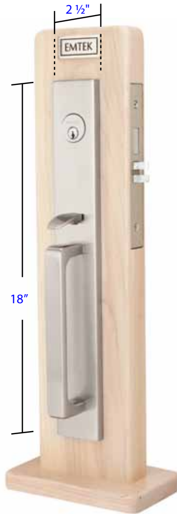
Lugano Trim Style Part # UL 3348