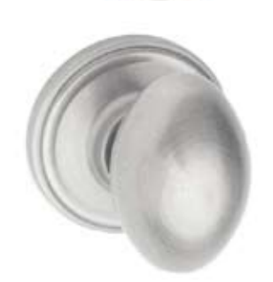
EK2000 Series Egg Style