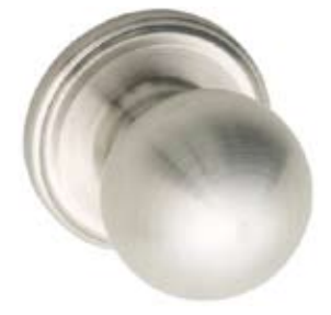
BK 2000 Series Ball Style